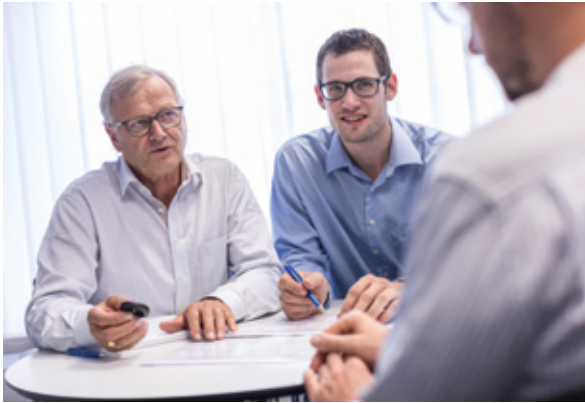
Consulting & development

From the idea to the finished product: With us you can rely on the skills of plastic and tool experts throughout the supply chain. From consultation to construction of the tool to series production and assembly, you get your plastic parts from a single source.