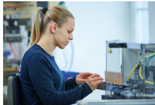
Assembly & automation technology