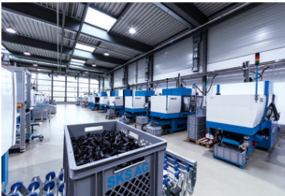
Injection moulding & series production